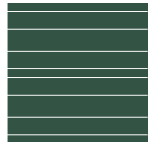
english school line

permanently printed and fused on ceramic surface.